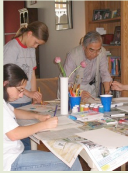
A scene from the NGCS 2006 Art-Making Party and Fundraiser

The New Gallery Concert Series would like to express our most sincere gratitude to The Aaron Copland Fund - 2005 & 2006 Supplemental Program for its generous support of our organization.