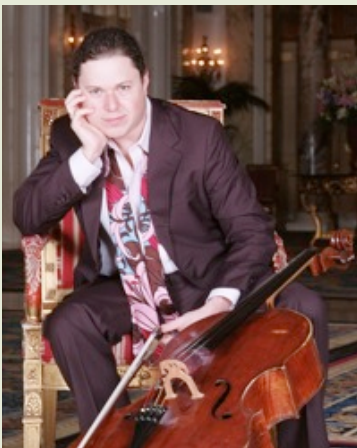
Matt Haimovitz, Cellist

• Wednesday, April 18, 2007, 7pm: "NGCS Benefit Concert with cellist, Matt Haimovitz" - It is an honor to have "the coolest cellist of our time" (The Boston Herald), Matt Haimovitz kick off our first annual benefit concert. Come celebrate his latest CD release, "After reading